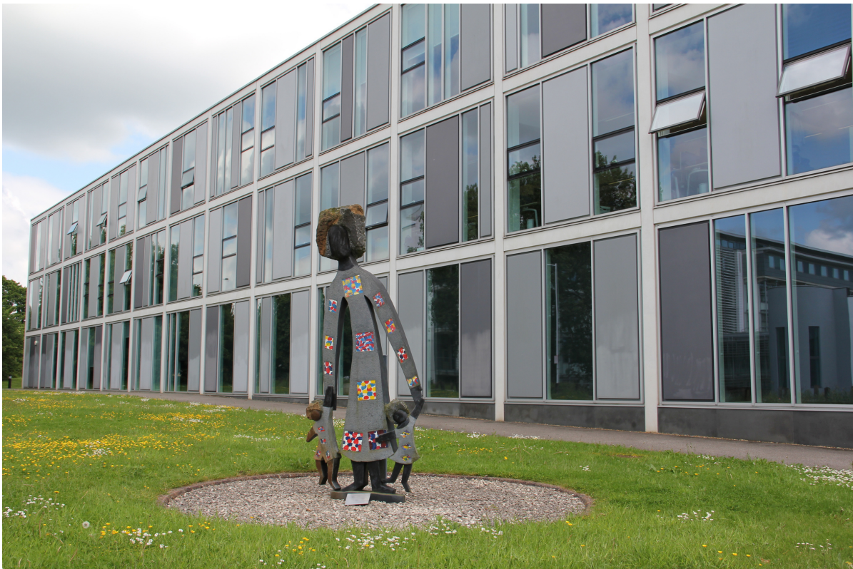
An image of the OU library